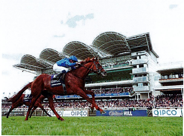
Notable Speech winning the QIPCO 2000 Guineas Stakes