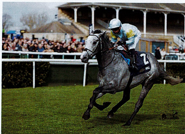
Charyn winning the Al Shaqab Lockinge Stakes

1st BELLOCCIO (8) 2nd A PIECE OF HEAVEN (7) 3rd FOX JOURNEY (9)