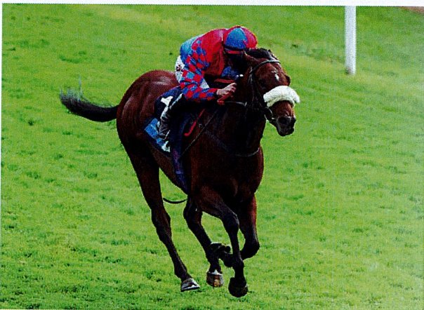
Big Evs winning the British Stallion Studs EBF Westow Stakes