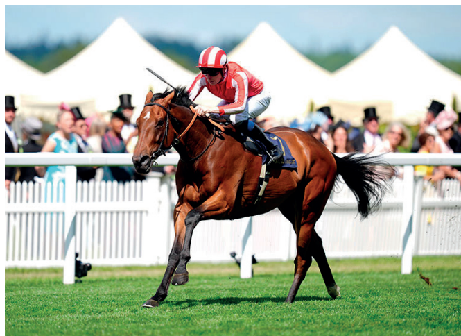
Isle of Jura winning the Hardwicke Stakes at Royal Ascot 2024.