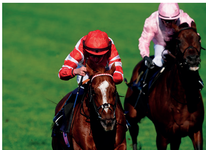
Hand of God winning the Golden Gates Stakes at Royal Ascot 2024.